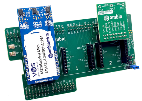
Apollo Audio Kit

The hardware kit is tested with close-talk, near-field, and far-field use cases under Amazon's standard testing conditions for False Rejection Rate (FRR), Response Accuracy Rate (RAR), False Alarm Rate (FAR). It successfully demonstrates low latency and accurate responses using wake word/command detection, audio compression codecs, and Bluetooth® Low Energy communication. Some always listening applications can operate for up to one year on standard alkaline or lithium batteries.