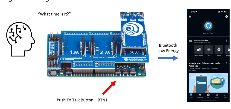
Figure 2-1: Light Version Demo